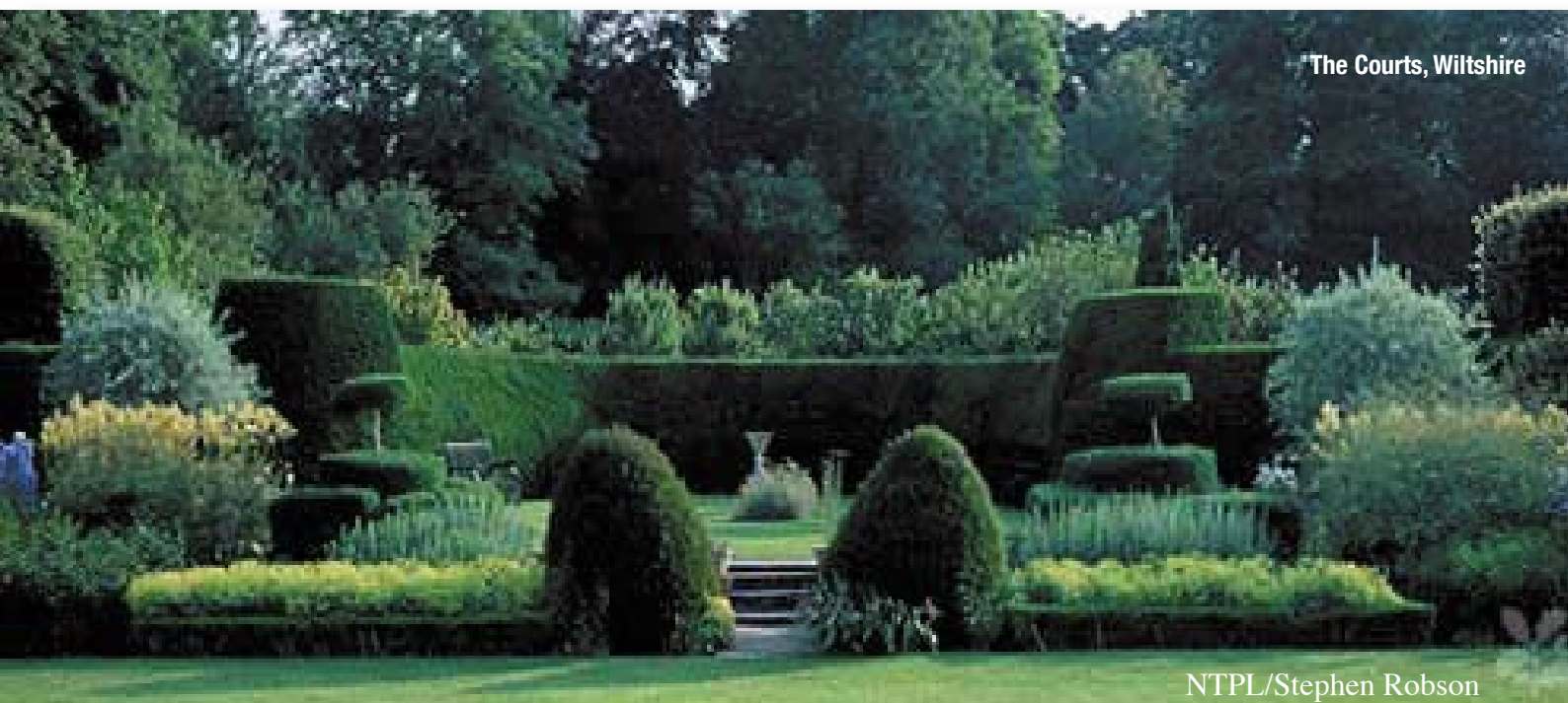
The Courts, Wiltshire