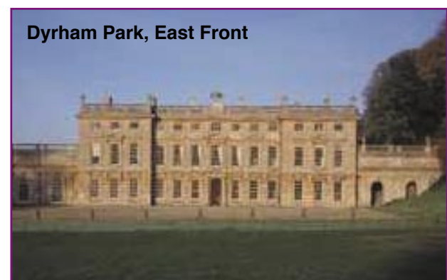
Dyrham Park, East Front

Forde Abbey, Chard, Somerset. Founded by Cistercian monks over 800 years ago, Forde Abbey was converted into a house in 1649. It contains fine paintings, furniture and outstanding Mortlake tapestries. www.fordeabbey.co.uk