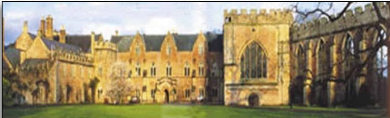
Bishop's Palace, Wells

Athelhampton House & Gardens, nr. Dorchester. Athelhampton is one of the finest 15th century manors in England. Built in 1485, it is an exceptional example of early Tudor architecture, set in an award winning garden. www.athelhampton.co.uk .