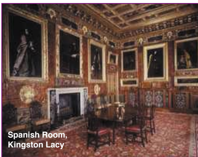
Spanish Room, Kingston Lacy